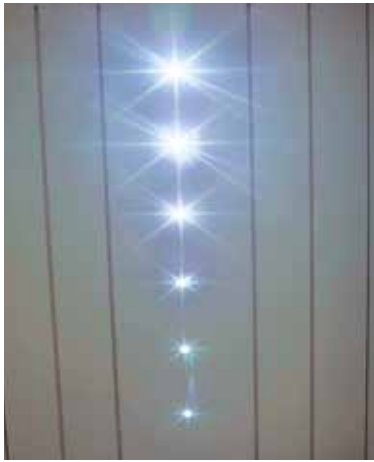
Shaft ceiling with LED spotlights, available as option.

The QubeHD has been designed to provide an effective solution for easy access specifically in the public and commercial sector where high loads are a requirement.